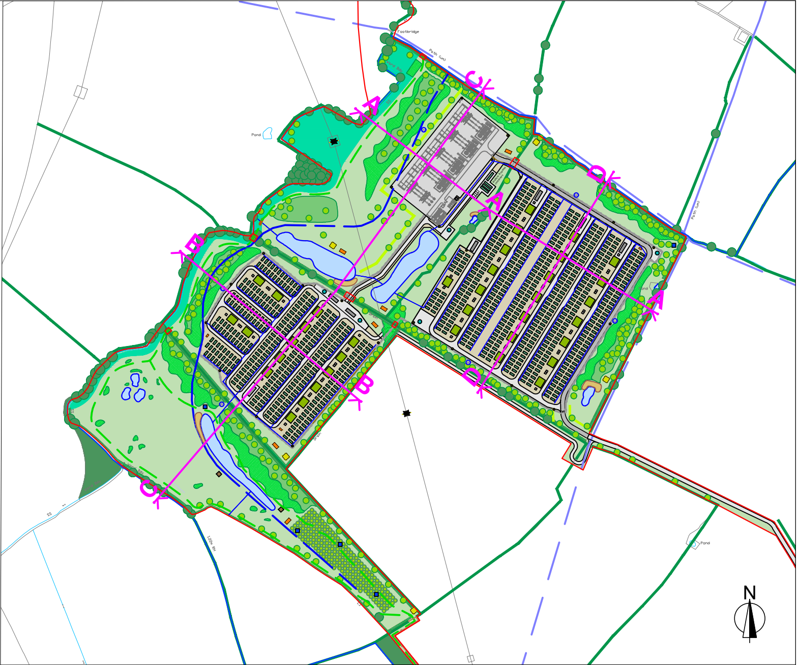
Inset map scale 1 : 5,000