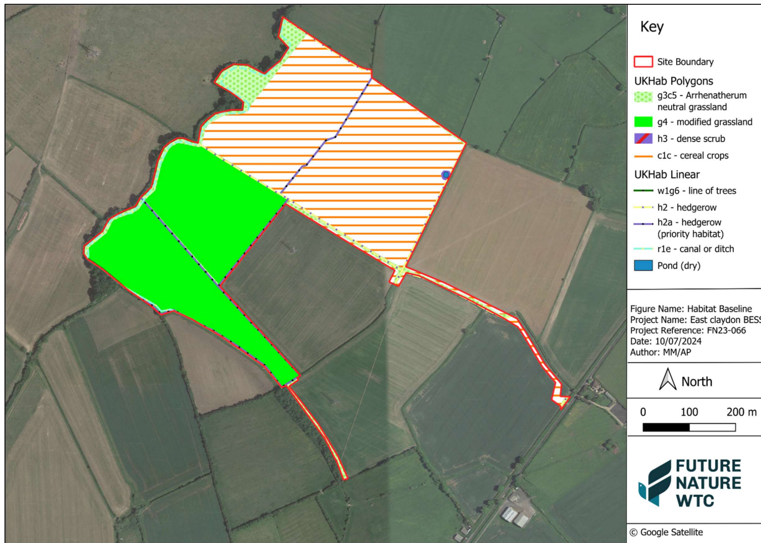
Figure 3: East Claydon BESS Habitat Baseline